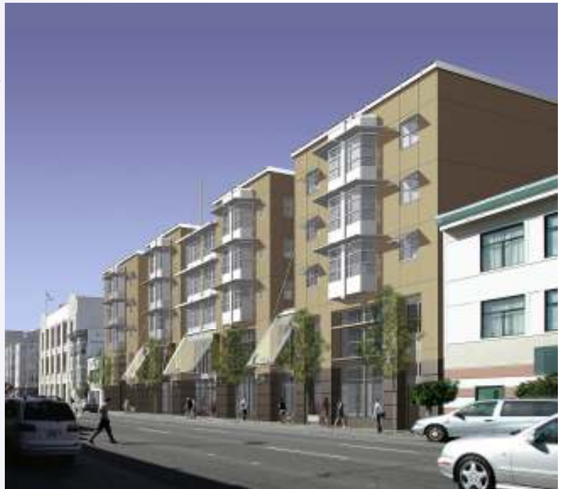
Rendering of 255 7th Street