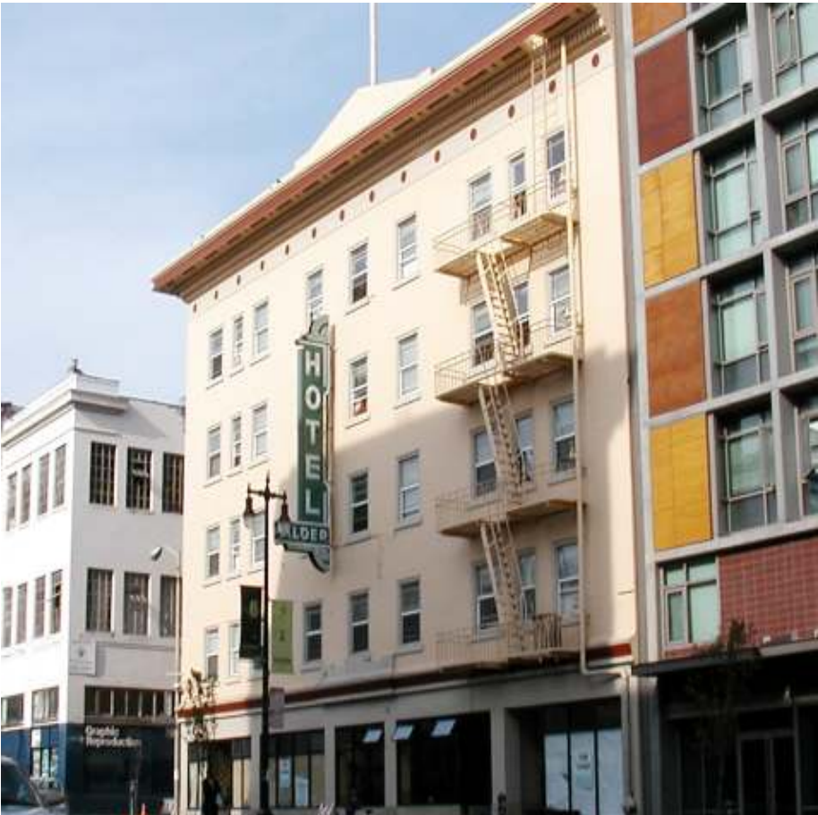
Alder Hotel located at 169 Sixth Street