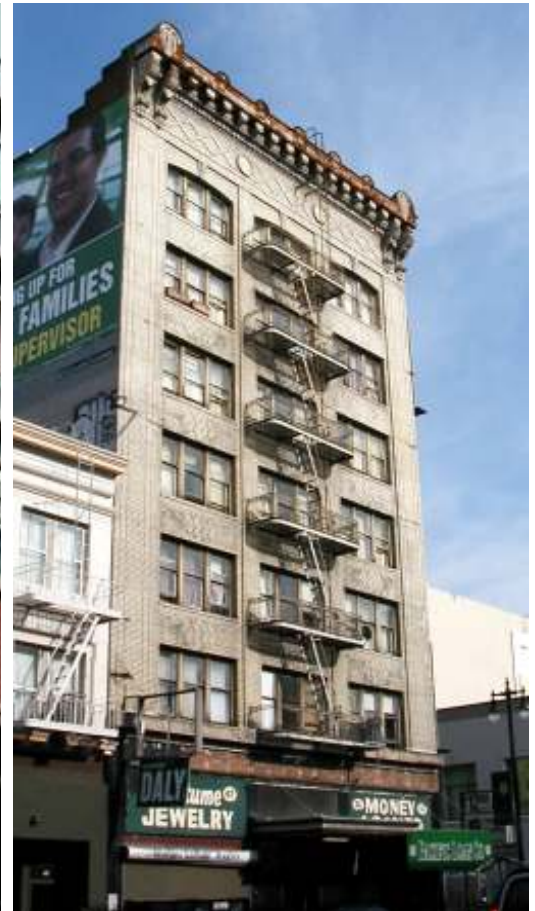
Hillsdale Hotel located at 51 Sixth Street