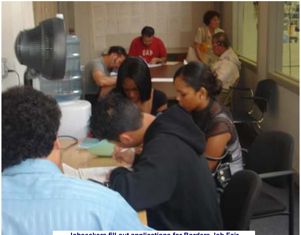
Jobseekers fill out applications for Borders Job Fair at SOMECE on August 9

Applicants can apply for positions at the Westfield Centre stores through SOMECE, located on 288 7 th Street (at Folsom), Monday through Friday from 9-11am and 1-4pm.